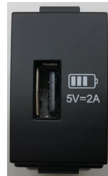
Front View W8301USBA