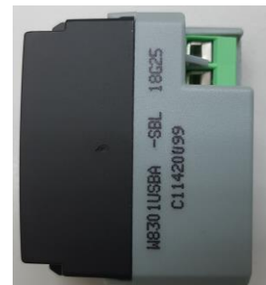
Side View/Right W8301USBA