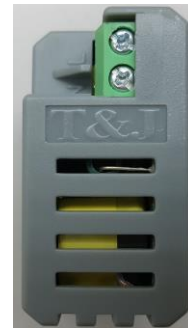
Back View W8301USBA