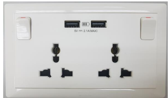
Front View of HB8618SDUSB-DP