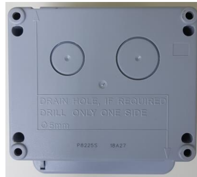
Bottom View of P8225S