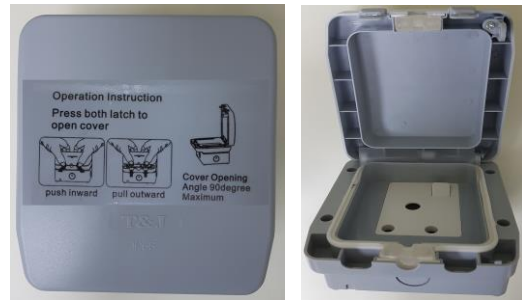
Front View of P8225S