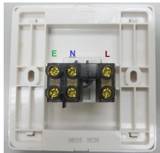
Back View of HB525