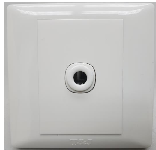
Front View of HB525