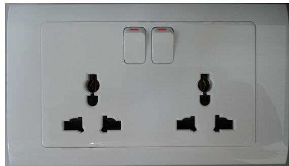
Front View of V818SD