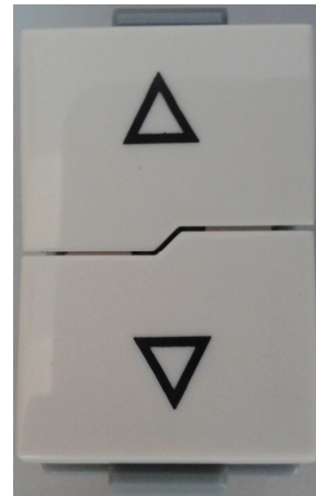
Front View of W2222