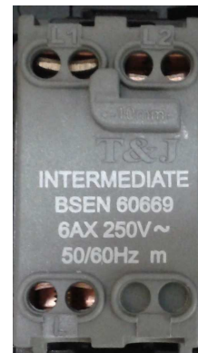
Back View of W2221