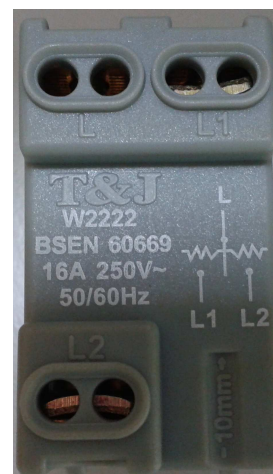
Back View of W2222