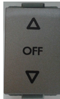
Front View of W2221