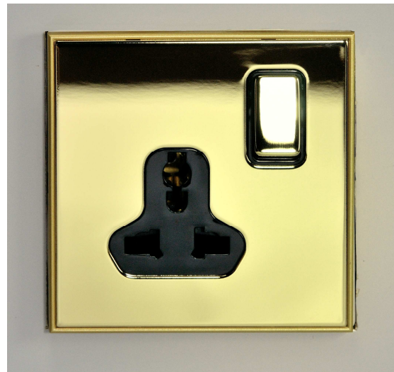
Front View of GC818S