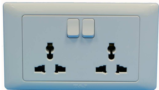
Front View of K818SD