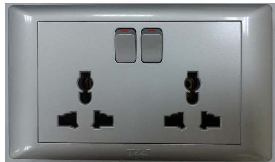
Front View of HB818SD