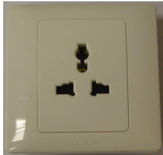
Front View of K818